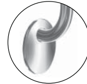
Optional Stainless Steel Bracket