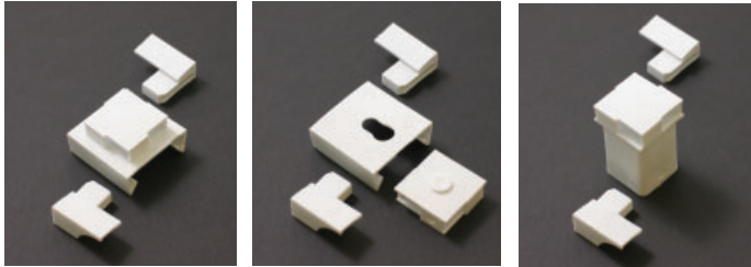
CE9271: Tegular Gridclip